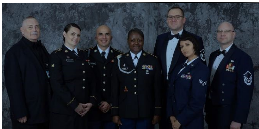
CA group at EANGUS Banquet Night