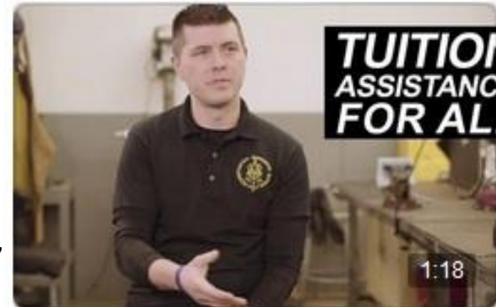
Tuition Assistance is being Withheld from Air National Guard