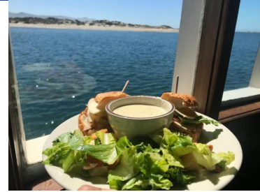
Fresh turkey croissant sandwich