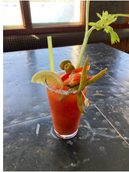
Bloody Mary's with seasonal vegetables